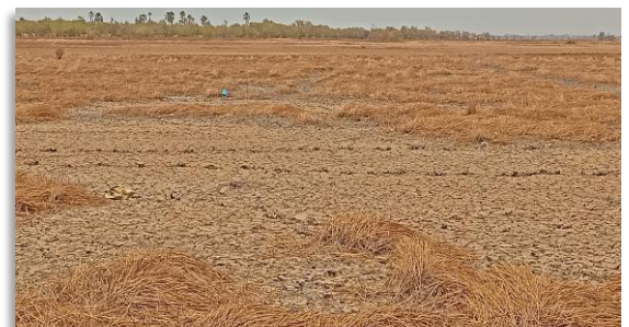
Figure 3: Farm rice affected by salt