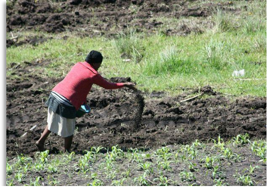
Figure 2: Fertiliser application